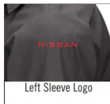
Left Sleeve Logo